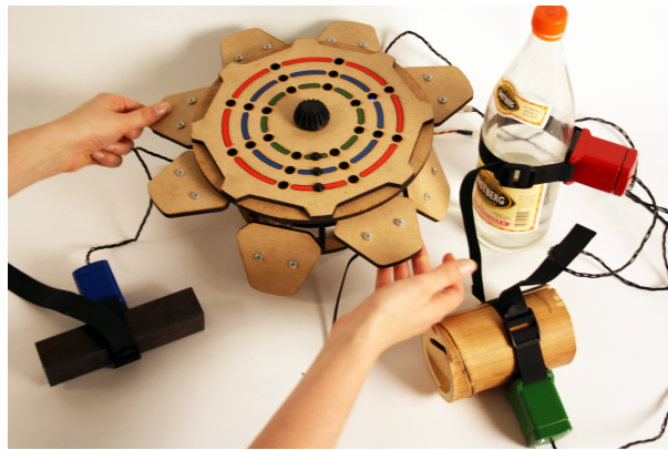
Fig. 2. Moving the flaps on the Drum Duino control panel with all three actuators in view

components, such as the actuator housing, can be reproduced. We intend to continue this trend in future Drum Duino prototypes by moving toward a modular kit where users are not limited in number of channels or in the length of the beat patterns.