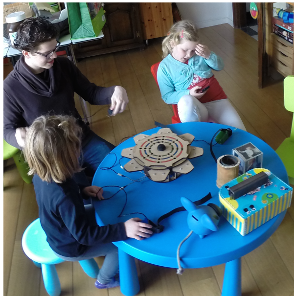
Fig. 3. Setting up the Drum Duino together with two participants

In order to evaluate this, we used the co-discovery method, also known as constructive interaction (Kemp and van Gelderen 1996; Als, Jensen, and Skov 2005). According to Kemp and van Gelderen (1996), it is specifically useful to understand experiences and impressions of new products, noting its usefulness in exploring novel artefacts. Using this method, children interact together with the product. Researchers evaluate with questions about use and experience, while observations during co-discovery are also a valuable source of insights. Although Van Kesteren et al. (2003) note that co-discovery results in less verbal comments, when compared with related methods such as think aloud protocols or peer tutoring, Als et al. (2005) found no significant difference between think aloud protocols and co-discovery. However, they stress the benefit of co-discovery since children may have trouble following instructions for a think aloud test. Furthermore, co-discovery has been used in similar projects where the usability of non-desktop based interfaces were evaluated, including a tangible interface for child story telling (Cassell and Ryokai 2001), and tools for children to program physical interactive environments (Montemayor et al. 2002). Given this, we chose to use co-discovery as our evaluation method.